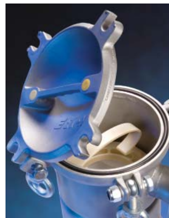
FLOWLINE II vessel incorporates an ergonomic integral cover handle for tool-free access. Unique internal body to basket seal prevents fluid bypass.