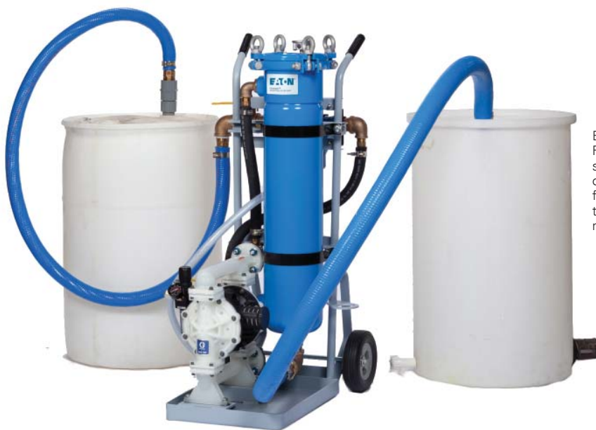
Eaton's FloWash Industrial Filter Cart is a flexible system that operates in-line or as a stand-alone portable filtration system. It is safe to operate and easy to maintain.