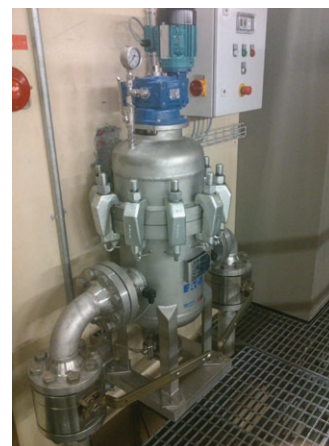
Eaton Model 2596 automatic self-cleaning strainer – picture shows special version for pressures up to 1,450 psi.

Even though the test phase of the new filter system at KWO is scheduled to run for several years, initial results are already clear. "The results are very good," says KWO. "So far we have had no outages and the system perfectly meets our needs in terms of maintaining and cleaning the baskets." Especially compared to the turbine lines where the sliding gate valves have not yet been retrofitted, it is clear that wear and tear has been significantly reduced - the amount of maintenance required and the associated costs have been minimized by the high-pressure automatic basket strainer.