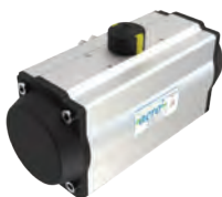
Rack & Pinion Pneumatic Actuator