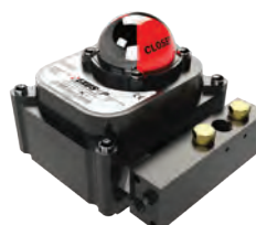
NEXUS-LP/LPX Discrete Valve Controller