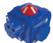
Quad4 Pneumatic Actuator