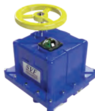
E-Series Electric Actuator