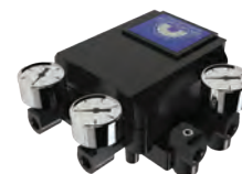
EXACTXL / P3 Pneumatic / Electro- Pneumatic Positioner