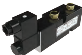
VECTOR Series Pilot Valves