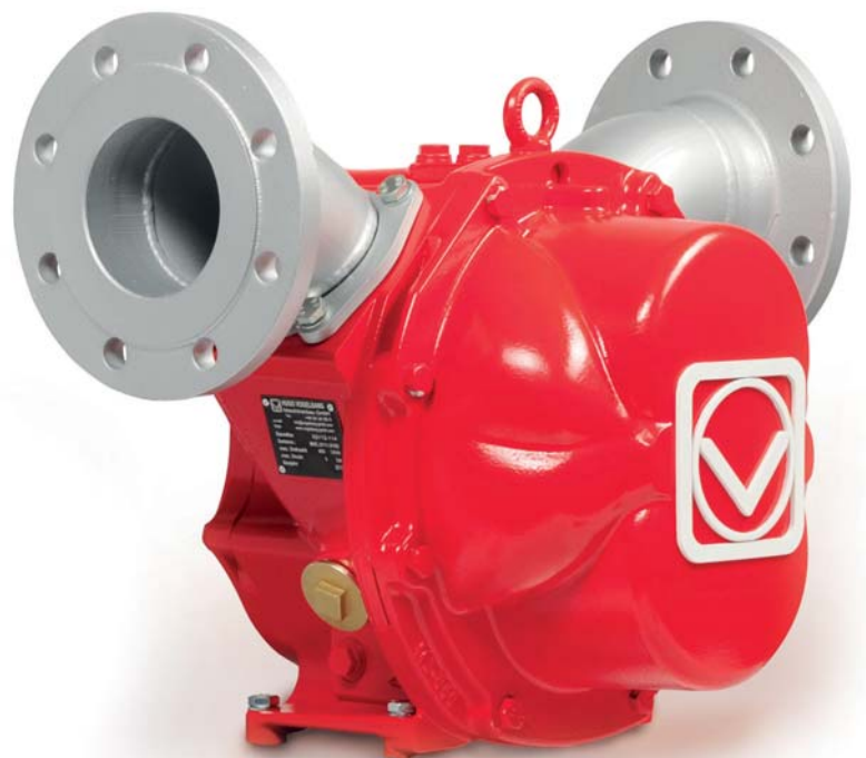
IQ112-Series Rotary Lobe Pump

The latest Vogelsang innovation in Rotary Lobe Pumps is here. Utilizing our exclusive HiFlo® rotor design, IQ series pumps have been specifically designed to reduce the number of spare parts, and maintenance time compared to any other lobe pump in the industry. The ability to pump highly viscous liquids, pulsation-free combined with unmatched design flexibility, makes IQ the next revolution of pumping technology.